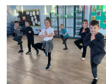
Y2 enjoying their dance lesson based on the Great Fire of London